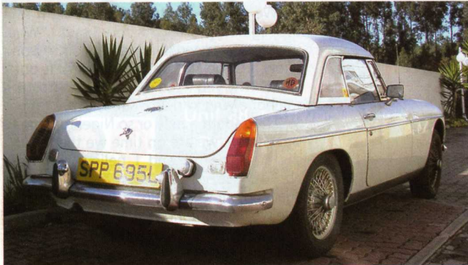
MG after arriving back in Spain

In November 2005 the choice was made with the help of the MGOC advice and magazine; a White 1973 MGB was located in Guildford, Surrey. All the necessary arrangements were agreed with the previous owner and car was checked over mechanically at