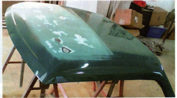
The hardtop under restoration