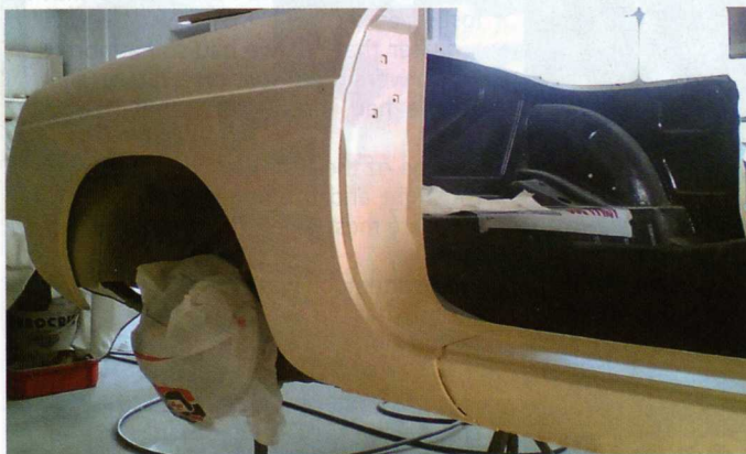
The shell stripped and resprayed