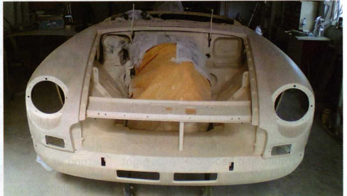
The shell stripped and resprayed